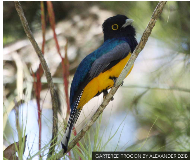
GARTERED TROGON

Please join our Facebook page and share photos of your program. Visit us at www.facebook.com/holbrooktravel . We hope to hear from you.