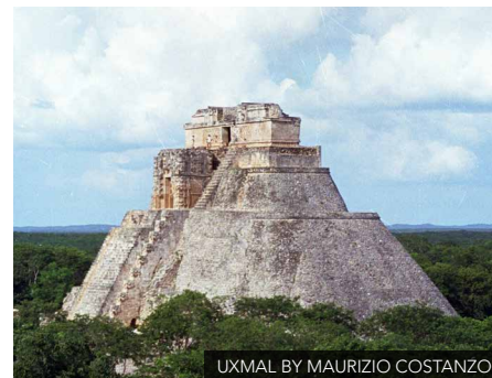
UXMAL BY MAURIZIO COSTANZO