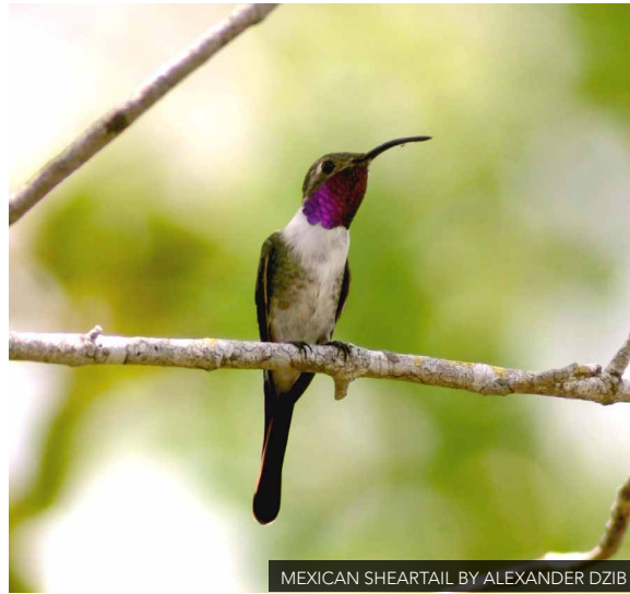
MEXICAN SHEARTAIL BY ALEXANDER DZIB

Rise early with a boxed breakfast for a field trip to Calakmul Biosphere Reserve. Calakmul is within the largest contiguous tract of tropical forest outside the Amazon Basin—Mesoamerica's 35-million-acre Mayan Forest—and provides refuge for many rare and endangered species. The Maya ruins here feel like the set of an Indiana Jones movie, half-buried in a thick tangle of jungle with massive pyramids towering above the canopy. From these ancient vantage points, look for soaring raptors, such as the magnificent King Vulture, the symbol for Calakmul. The roads in and out offer a good chance for large gamebirds such as Ocellated Turkey, Crested Guan, and Great Curassow—all relatively common here. Possibilities along forested trails include Thicket Tinamou, Gartered Trogon, Collared Aracari, Keel-billed Toucan, Black-faced Antthrush, various woodcreepers, Northern Bentbill, Eye-ringed Flatbill, Bright-rumped Attila, Green Jay, White-bellied Wren, and many neotropical migrants during the winter months. Have a picnic lunch on site before returning to the hotel for more birding in the nearby gardens. Dinner at the hotel. Overnight at Chicanna Ecovillage Resort. (BLD)