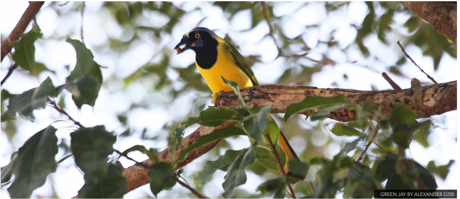
GREEN JAY