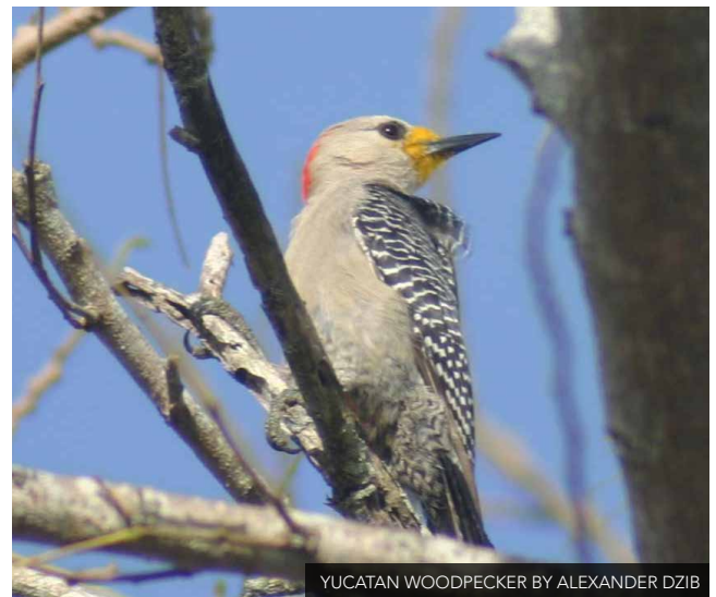
YUCATAN WOODPECKER BY ALEXANDER DZIB